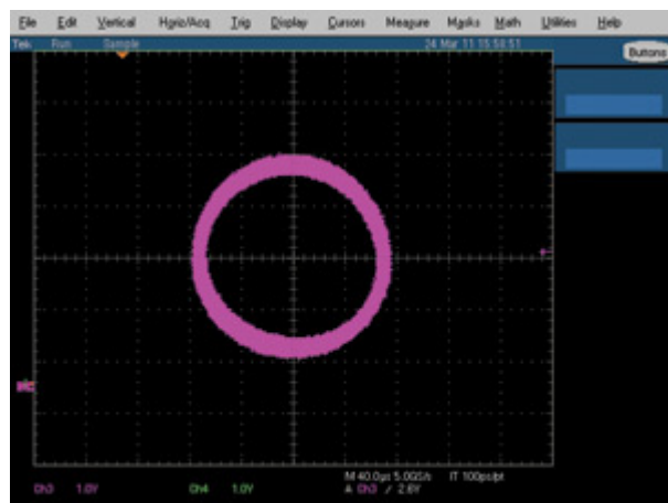
Figure 3 When swept in frequency, the phase varies from -89 to -91°.

The Mixed Signal Integration MSFS5 selectable lowpass/bandpass switched-capacitor filter removes the harmonics from a square wave you apply to its inputs. The clock for the MSFS5 is 100 times the