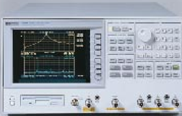
The HP 4396B RF VNA covers 100 kHz to 1.8 GHz as a VNA and an impedance analyzer; the unit can also function as a spectrum analyzer from 2 Hz to 1.8 GHz.

Modern instruments' complexity affects both frequency- and time-domain devices. Still, some problems are characteristic of the kinds of high-frequency measurements that you usually make in the frequency domain. Steve Roach, a design engineer at Hewlett-Packard's Colorado Springs, CO, Electronic Measurements Division facility, points out a particularly impor-