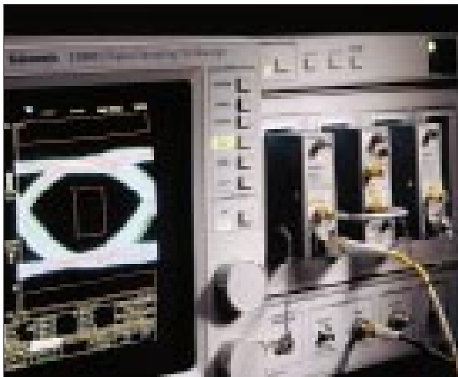
The 11801C sequential-equivalent-time-sampling digital oscilloscope from Tektronix can accept four single-channel plug-ins. The SD32 plug-in samples 50-GHz-bandwidth signals.

Still, most spectrum analyzers don’t provide phase information, whereas many network analyzers do. That is, vector network analyzers (VNAs) do. Therefore, you can argue that VNAs are more general than spectrum analyzers.