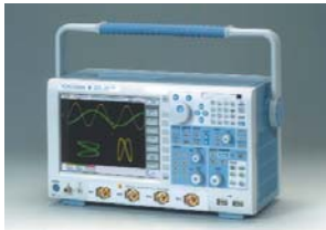
Yokogawa's DL9000 offers up to 1.5 GHz bandwidth in a general-purpose scope

Yokogawa's DL9000 series ranges up to 1.5 GHz in band-