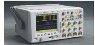
Agilent's 6000 scopes aim to finally replace the last of the analogue scopes

Customers can order the 6000 series units with an integrated 16-channel logic analyser module for mixed-signal operation, or add the logic analysis later in an upgrade; basic instruments are