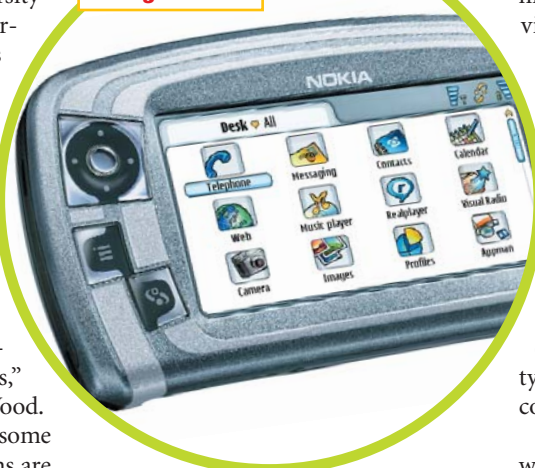
The Nokia 7710 smart phone runs the latest Symbian Series 90 operating system and features a landscape 640×320-pixel, color touchscreen display.