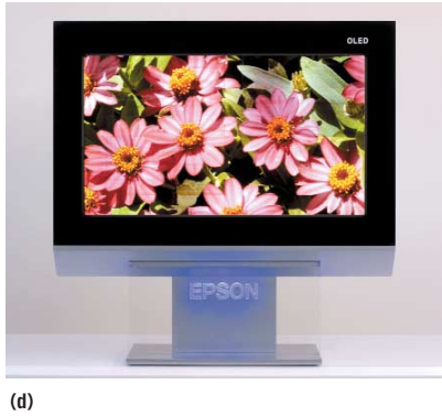
An OLED can display a wider color range than either an STN or a TFT LCD (a, courtesy Philips). Early pioneering systems containing OLEDs instead of LCDs are beginning to emerge (b, courtesy Ovideon). Samsung showcased a 21-in. OLED monitor with claimed 1920×1200-pixel resolution and 5000-to-1 contrast ratio at this year's CES (c), whereas Seiko Epson last May touted a 40-in. model (d).