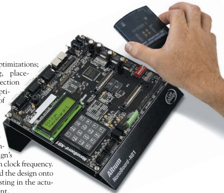
Figure 2 Altium Designer integrates board- and FPGA-level system design, embedded-software development, and pc-board layout within a single user environment.

Major FPGA vendors Xilinx and Altera, which hold more than 80% of the market share, provide extensive IP li-