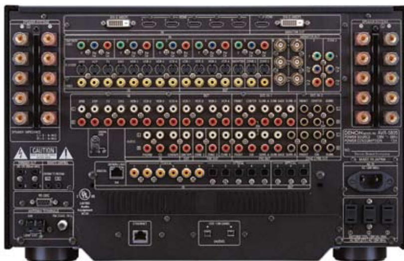
Figure 1 The bewildering array of back-panel connectors on this Denon receiver illustrates the appeal of digital-enabled consolidation.

When Intel announced the formation of the DDWG (Digital Display Working Group) at the fall 1998 Developer Forum, the company put the stamp of approval on an interface technology, DVI, which Silicon Image had been promoting for several years as the TMDS (transition-minimized-differential-signaling)-based PanelLink topology. At the time, DVI wasn’t the only game in town; in fact, the VESA (Video Electronics Standards Association) was championing two other TMDS-based approaches: P&D (plug and display) and DFP (digital flat panel). Apple’s ADC (Apple Display Connector) was also TMDS-derived, but the connector and cabling additionally carried USB and display power buses. National