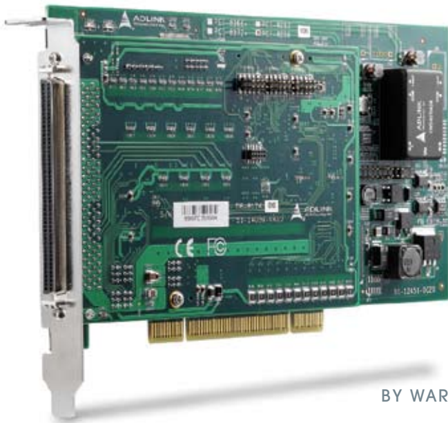
Figure 1 The Adlink PCI-8174 is an off-the-shelf stepper and servo controller for multi-axis, time-critical motion sequences.

AS NEW DESIGNS COMBINE ELECTRONIC CIRCUITRY, MECHANICAL ACTUATORS, AND MICROPROCESSOR SOFTWARE, A GROWING PERCENTAGE OF EMBEDDED DEVELOPMENT FALLS UNDER THE RECENTLY REVIVED "MECHATRONICS" MONIKER.