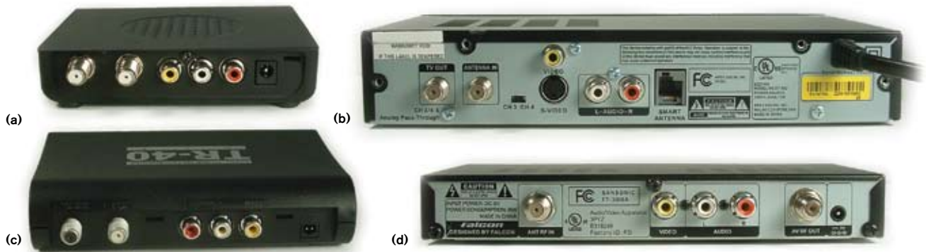
Figure 3 Back-panel perspectives of Access HD's DTA-1080D (a), Apex Digital's DT502 (b), Dish Network's TR-40 CRA (c), and Sansonic's FT-300A (d) reveal the hardware enhancements that Apex Digital's product provides.

than-average disparity between BOM cost and price. By passing along some or all of this incremental profit to distributors and retailers, they cultivate a retail-shelf-space preference for their products, thereby creating consumer demand by squeezing competing alternatives off re-