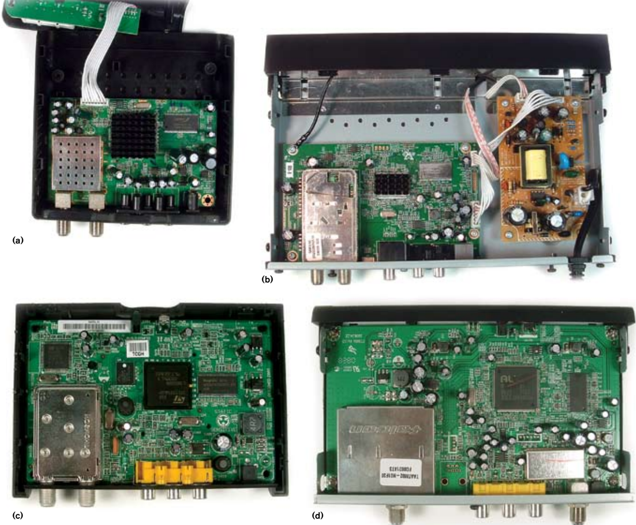
Figure 2 Notable internal disparities magnify noticeable exterior differences among Access HD's DTA-1080D (a), Apex Digital's DT502 (b), Dish Network's TR-40 CRA (c), and Sansonic's FT-300A (d). Note that the excess thermal paste in the area surrounding the DT502's Realtek RTD2885 was the inadvertent result of my removal and replacement of the SoC's passive heatsink; the excess paste was not present when the CECEB originally came to me.

“clear QAM” (quadrature-amplitude modulation) for cable-television support. Simply stated, CECEBs strictly convert ATSC to NTSC (National Television System Committee) for legacy-TV compatibility.