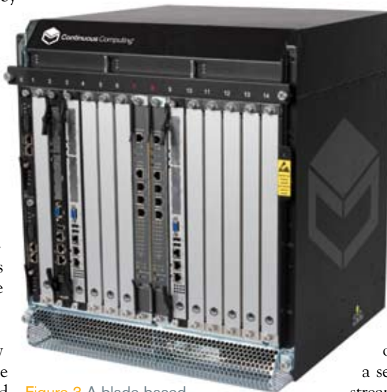
Figure 3 A blade-based appliance is amenable to scalable DPI capabilities.

By using DPI, operators can build plans showing an understanding of how customers use their service. You might be able to optimize some sample plans for Web surfing and e-mail sessions of approximately 64 kbps but with a tight bandwidth cap on any P2P traffic. Others might offer a service that allows YouTube-style video streaming at approximately 250 kbps but with limits on high-definition video streaming of 4 Mbps or higher. Another service might attract gamers, offering low latency