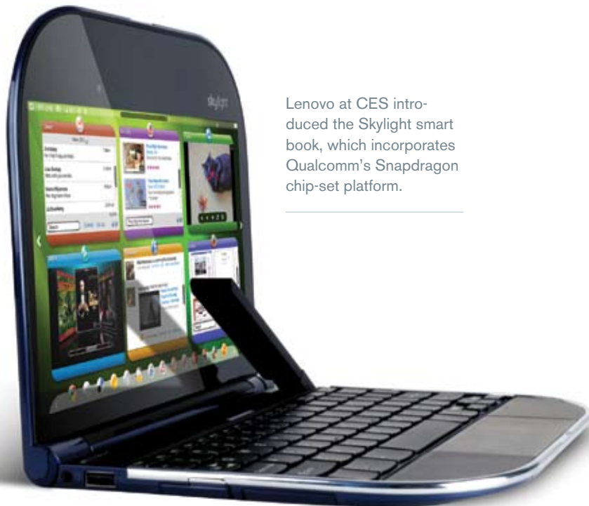
Lenovo at CES introduced the Skylight smart book, which incorporates Qualcomm's Snapdragon chip-set platform.