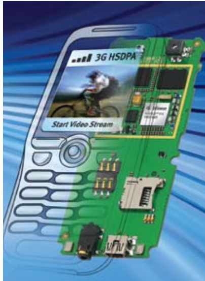
The XMM 6130 platform targets the entry-level Internet-browsing-phone market, supporting 3G HSDPA. It integrates an ARM11-based microcontroller, baseband digital and analog features, and power-management functions.

its CG2900 device, which incorporates Bluetooth low-energy technology. With the CG2900, consumers can use their mobile phones to collect and display information from Bluetooth low-energy sensors and to link these devices to the Internet for applications such as remote health-care and fitness monitoring. Using the CG2900, the company reports, mobile phones can become the hubs of a varied ecosystem of coin-cell-powered devices, including watches, medical and sports monitors, home and proximity sensors, battery-level monitors, and temperature and pressure indicators. The