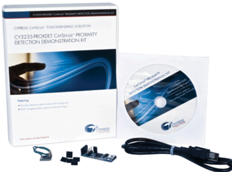
Figure 1 The Cypress Semiconductor CY3235 proximity-detection demonstration kit shows how to use the PSoC (programmable-system-on-chip) CapSense-enabled CY8C21434 to accurately sense the proximity of a hand or a finger along the length of a wire antenna.

Capacitive sensing started to take off with the ubiquitous adoption of touchscreen interfaces in smartphones and tablets, such as the iPhone. As the sensing technology continues to mature and the production costs drop, capacitive sensing not only supports explicit touch and gestures but also, through proximity sensing, provides systems with more information about how the user is using the system. A key hidden-interface feature is the ability to detect and reject unintended touches, such as when a user's cheek touches the interface when he places the phone to his ear or when a user grips a device, thereby touching its edges.