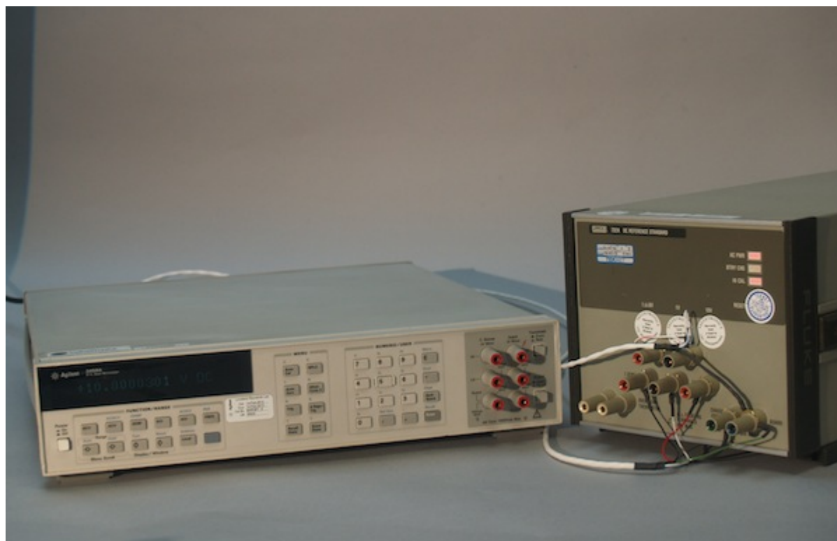
Figure 1: The Fluke 732A transfer standard with the Agilent 3458A DMM transfer standard.

the older 732A has a maximum 12 hour battery life, limiting how far it can be easily transported. An Agilent 3458A with option 002 (4 ppm DC) is our transfer standard (see Figure 1). The 3458A is calibrated by Agilent in Loveland, CO, where a Josephson Junction is in use.